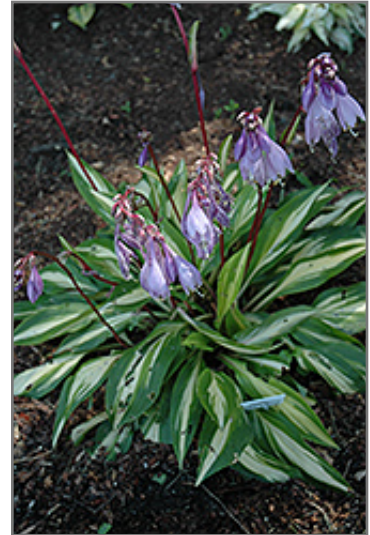
Cherry Berry Hosta in bloom