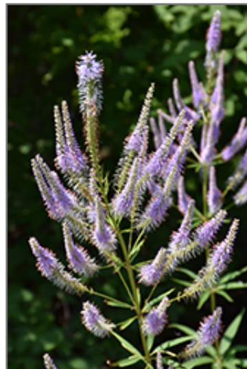
Fascination Culver's Root flowers