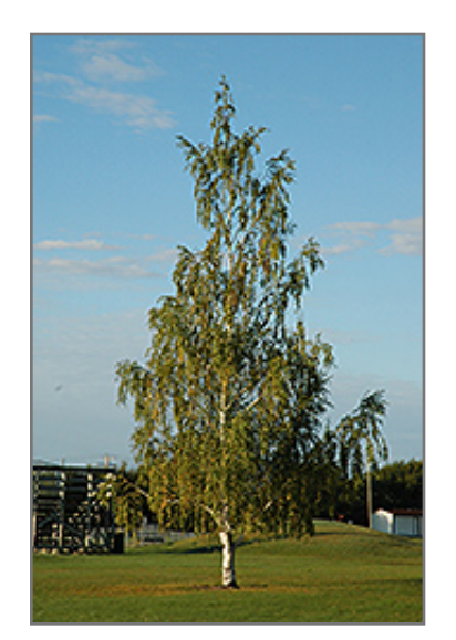
Cutleaf Weeping Birch