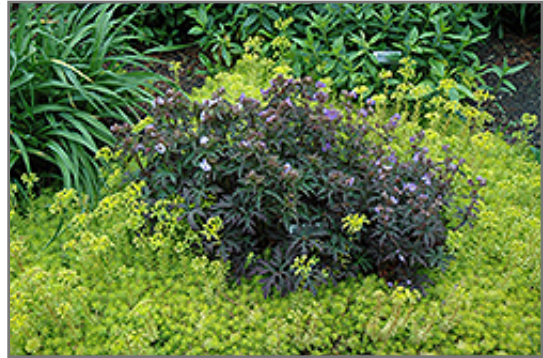
Dark Reiter Cranesbill in bloom