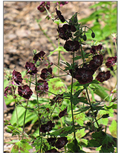
Samobor Cranesbill in bloom

Samobor Cranesbill is recommended for the following landscape applications;