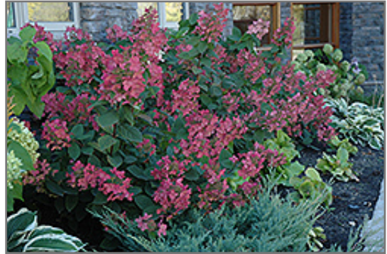
Pink Diamond Hydrangea in fall