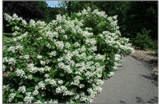
Pink Diamond Hydrangea in bloom

This shrub performs well in both full sun and full shade. It prefers to grow in average to moist conditions, and shouldn't be allowed to dry out. It is not particular as to soil type or pH. It is highly tolerant of urban pollution and will even thrive in inner city environments. Consider applying a thick mulch around the root zone in winter to protect it in exposed locations or colder microclimates. This is a selected variety of a species not originally from North America.