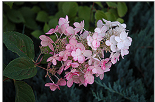
Pink Diamond Hydrangea flowers