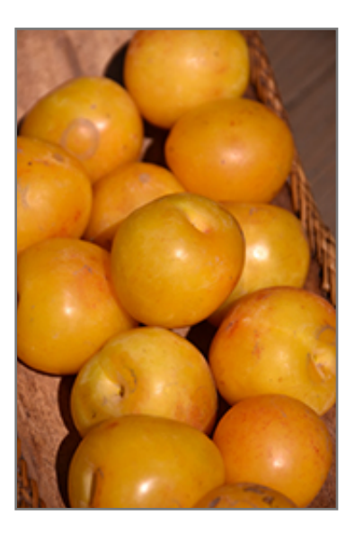
Brookgold Plum fruit