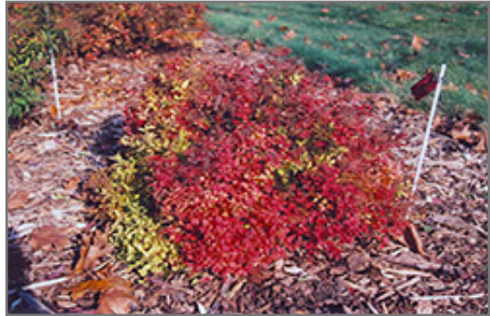
Dakota Goldcharm Spirea in fall

This shrub should only be grown in full sunlight. It prefers to grow in average to moist conditions, and shouldn't be allowed to dry out. It is not particular as to soil type or pH. It is highly tolerant of urban pollution and will even thrive in inner city environments. This is a selected variety of a species not originally from North America.