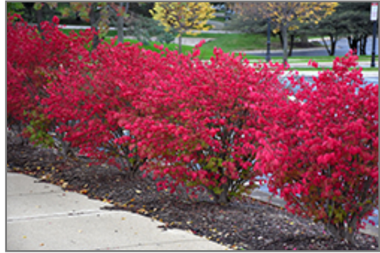
Fire Ball Burning Bush in fall

Fire Ball Burning Bush is recommended for the following landscape applications;