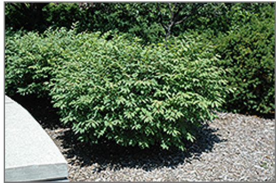
Fire Ball Burning Bush