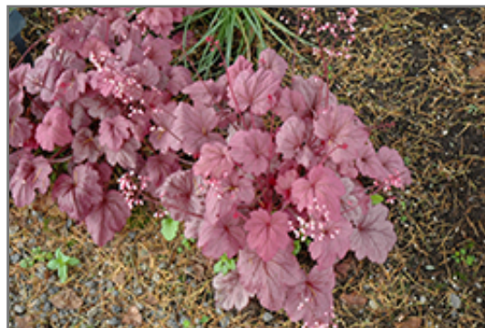
Georgia Plum Coral Bells