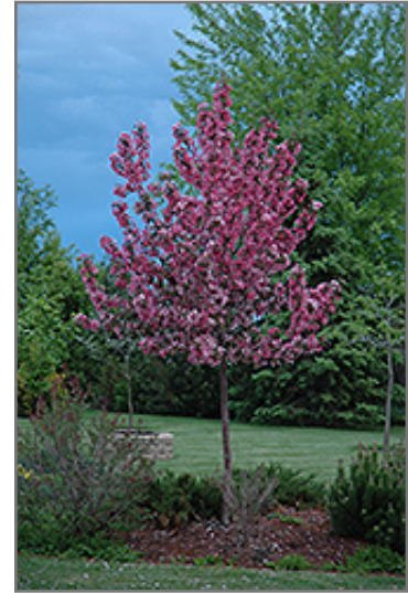
Rudolph Flowering Crab in bloom

Rudolph Flowering Crab is recommended for the following landscape applications;