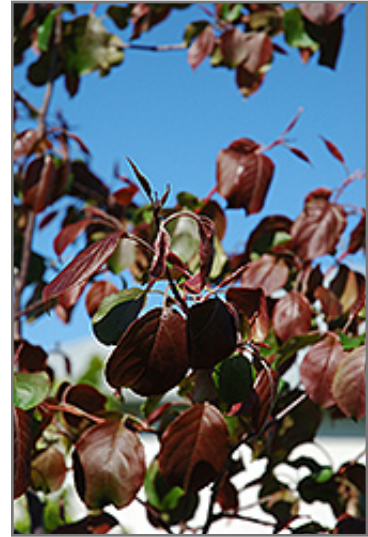
Rudolph Flowering Crab foliage

This tree should only be grown in full sunlight. It prefers to grow in average to moist conditions, and shouldn't be allowed to dry out. It is not particular as to soil type or pH. It is highly tolerant of urban pollution and will even thrive in inner city environments. This particular variety is an interspecific hybrid.