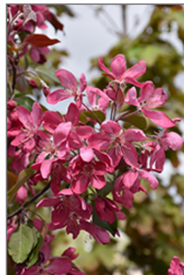
Royal Mist Flowering Crab flowers

Royal Mist Flowering Crab is recommended for the following landscape applications;