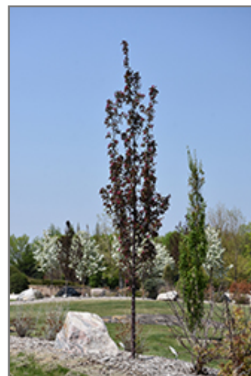
Royal Mist Flowering Crab in bloom