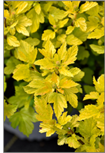
Tiny Wine Gold Ninebark foliage

Tiny Wine Gold Ninebark is recommended for the following landscape applications;