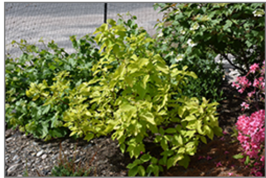
Neon Burst Dogwood