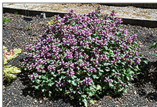
Beacon Silver Spotted Dead Nettle in bloom