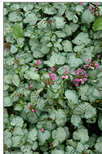
Beacon Silver Spotted Dead Nettle flowers