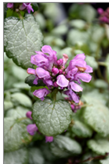
Red Nancy Spotted Dead Nettle flowers