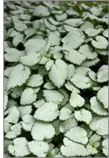
Red Nancy Spotted Dead Nettle foliage

Red Nancy Spotted Dead Nettle is a fine choice for the garden, but it is also a good selection for planting in outdoor pots and containers. Because of its spreading habit of growth, it is ideally suited for use as a 'spiller' in the 'spiller-thriller-filler' container combination; plant it near the edges where it can spill gracefully over the pot. Note that when growing plants in outdoor containers and baskets, they may require more frequent waterings than they would in the yard or garden. Be aware that in our climate, most plants cannot be expected to survive the winter if left in containers outdoors, and this plant is no exception. Contact our experts for more information on how to protect it over the winter months.