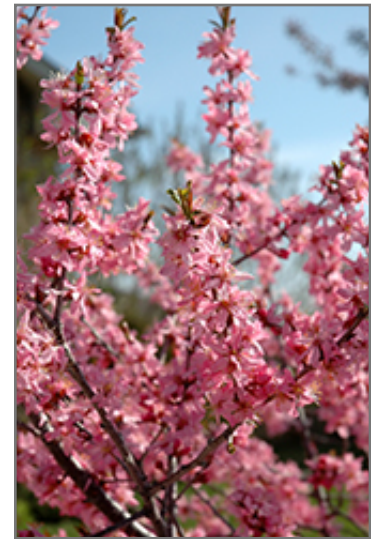
Muckle Plum flowers