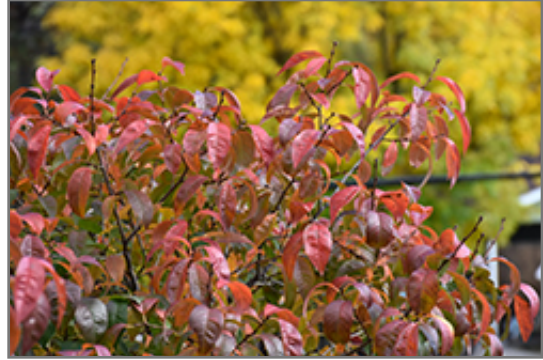
Muckle Plum in fall

This shrub should only be grown in full sunlight. It does best in average to evenly moist conditions, but will not tolerate standing water. It is not particular as to soil type or pH. It is highly tolerant of urban pollution and will even thrive in inner city environments. This particular variety is an interspecific hybrid.