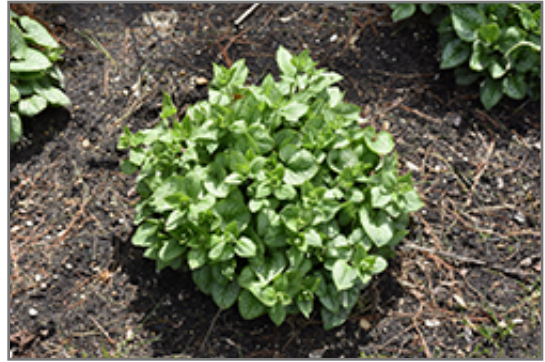
Jack of Diamonds Bugloss

Jack of Diamonds Bugloss will grow to be about 14 inches tall at maturity, with a spread of 30 inches. When grown in masses or used as a bedding plant, individual plants should be spaced approximately 28 inches apart. It grows at a medium rate, and under ideal conditions can be expected to live for approximately 10 years. As an herbaceous perennial, this plant will usually die back to the crown each winter, and will regrow from the base each spring. Be careful not to disturb the crown in late winter when it may not be readily seen!