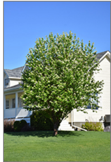
Amur Cherry