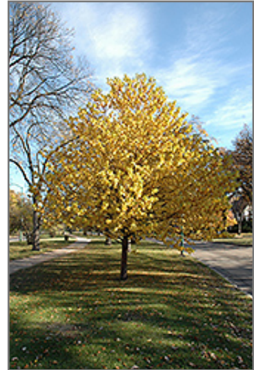
Amur Cherry in fall

This tree should only be grown in full sunlight. It does best in average to evenly moist conditions, but will not tolerate standing water. It is not particular as to soil type or pH. It is somewhat tolerant of urban pollution. This species is not originally from North America.