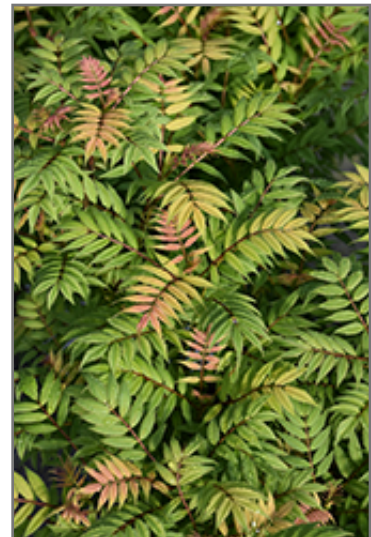
Mr. Mustard False Spirea foliage