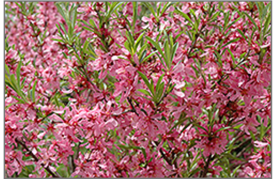
Russian Almond flowers