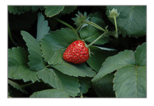
Fort Laramie Strawberry fruit

Fort Laramie Strawberry features dainty white daisy flowers with yellow eyes along the stems from late spring to mid summer. Its tomentose round compound leaves remain green in colour throughout the season. It features an abundance of magnificent scarlet berries from early to late summer.