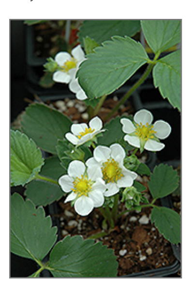
Fort Laramie Strawberry flowers