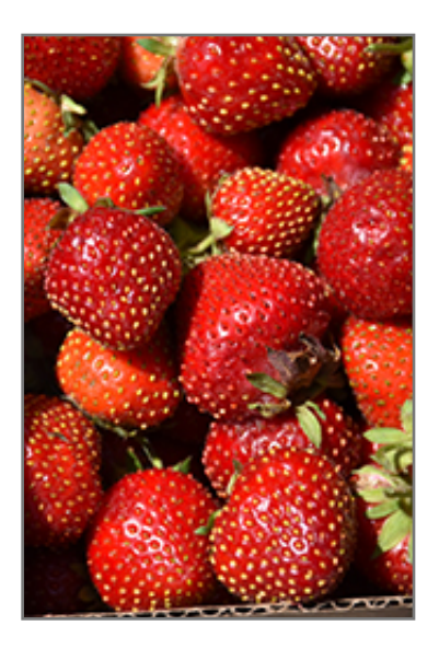
Fort Laramie Strawberry fruit

Fort Laramie Strawberry is a good choice for the edible garden, but it is also well-suited for use in outdoor pots and containers. Because of its spreading habit of growth, it is ideally suited for use as a 'spiller' in the 'spiller-thriller-filler' container combination; plant it near the edges where it can spill gracefully over the pot. Note that when growing plants in outdoor containers and baskets, they may require more frequent waterings than they would in the yard or garden. Be aware that in our climate, most plants cannot be expected to survive the winter if left in containers outdoors, and this plant is no exception. Contact our experts for more information on how to protect it over the winter months.