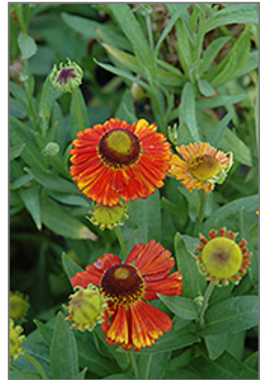
Sahin's Early Flowerer Sneezeweed flowers

This plant will require occasional maintenance and upkeep, and should be cut back in late fall in preparation for winter. It is a good choice for attracting butterflies to your yard, but is not particularly attractive to deer who tend to leave it alone in favor of tastier treats. Gardeners should be aware of the following characteristic(s) that may warrant special consideration;