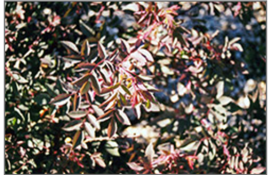
Red Leaf Rose foliage

This shrub should only be grown in full sunlight. It does best in average to evenly moist conditions, but will not tolerate standing water. It is not particular as to soil type or pH. It is highly tolerant of urban pollution and will even thrive in inner city environments. This species is not originally from North America.