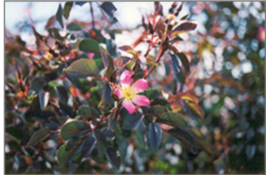
Red Leaf Rose flowers

This is a high maintenance shrub that will require regular care and upkeep, and is best pruned in late winter once the threat of extreme cold has passed. It is a good choice for attracting bees to your yard. Gardeners should be aware of the following characteristic(s) that may warrant special consideration;