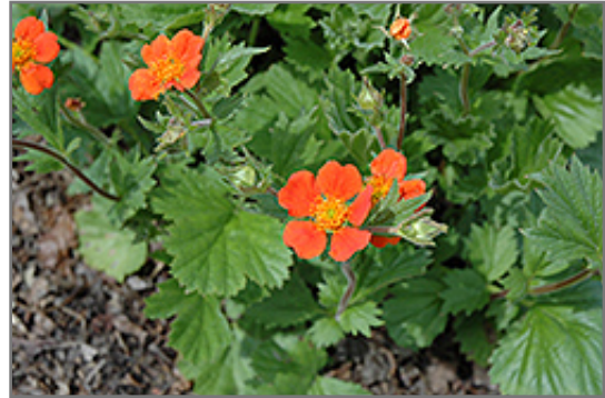
Boris Avens flowers

Boris Avens is recommended for the following landscape applications;