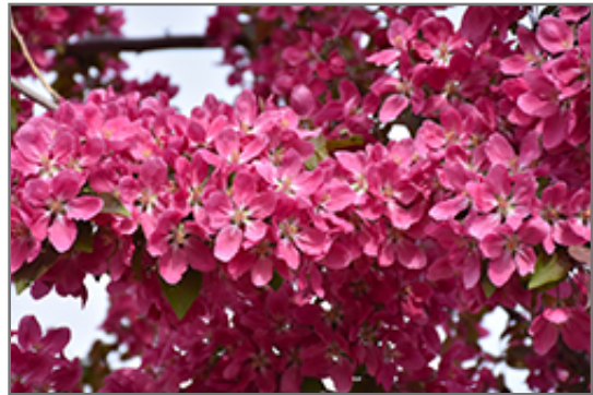
Big River Flowering Crab flowers