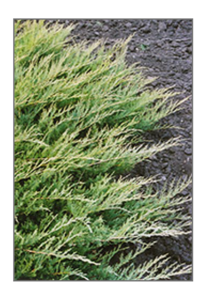
Broadmoor Juniper foliage