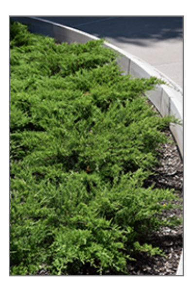
Broadmoor Juniper