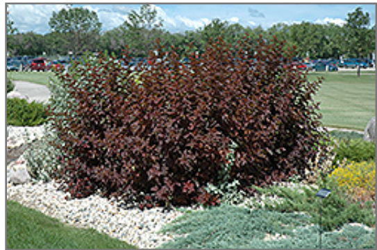
Diablo Ninebark