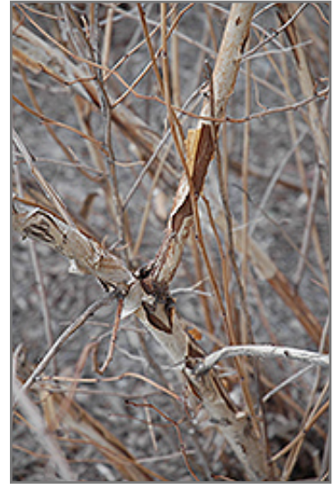
Diablo Ninebark bark

This shrub does best in full sun to partial shade. It is very adaptable to both dry and moist locations, and should do just fine under average home landscape conditions. It is not particular as to soil type or pH. It is highly tolerant of urban pollution and will even thrive in inner city environments. This is a selection of a native North American species.