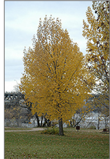
Siouxland Poplar in fall