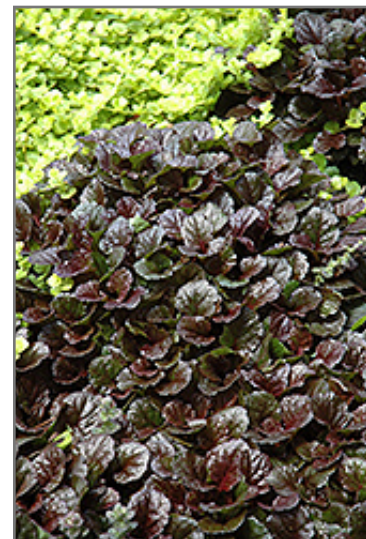
Black Scallop Bugleweed