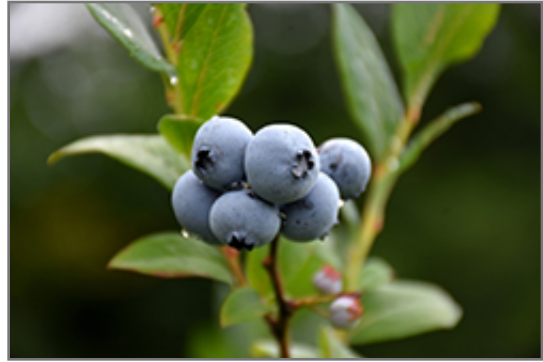
Northsky Blueberry fruit

Northsky Blueberry features dainty clusters of white bell-shaped flowers with shell pink overtones hanging below the branches in mid spring. It has green deciduous foliage. The glossy oval leaves turn an outstanding scarlet in the fall. It features an abundance of magnificent blue berries in mid summer.