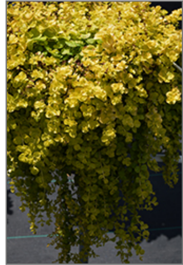
Golden Creeping Jenny foliage

Golden Creeping Jenny is a fine choice for the garden, but it is also a good selection for planting in outdoor containers and hanging baskets. Because of its spreading habit of growth, it is ideally suited for use as a 'spiller' in the 'spiller-thriller-filler' container combination; plant it near the edges where it can spill gracefully over the pot. Note that when growing plants in outdoor containers and baskets, they may require more frequent waterings than they would in the yard or garden. Be aware that in our climate, most plants cannot be expected to survive the winter if left in containers outdoors, and this plant is no exception. Contact our experts for more information on how to protect it over the winter months.