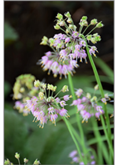
Nodding Onion flowers

This plant should only be grown in full sunlight. It does best in average to evenly moist conditions, but will not tolerate standing water. It is not particular as to soil type or pH, and is able to handle environmental salt. It is highly tolerant of urban pollution and will even thrive in inner city environments. This species is native to parts of North America. It can be propagated by multiplication of the underground bulbs.