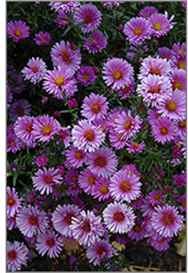
Purple Dome Aster flowers

Purple Dome Aster is recommended for the following landscape applications;