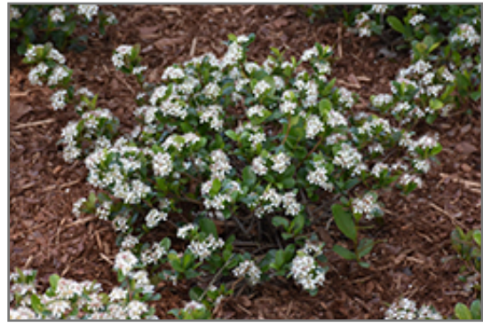
Low Scape Mound Aronia in bloom