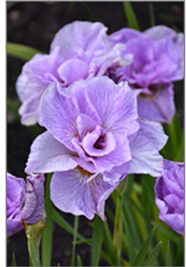
Pink Parfait Siberian Iris flowers