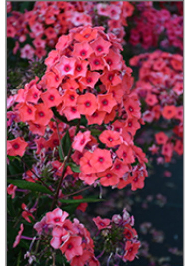
Tequila Sunrise Garden Phlox flowers