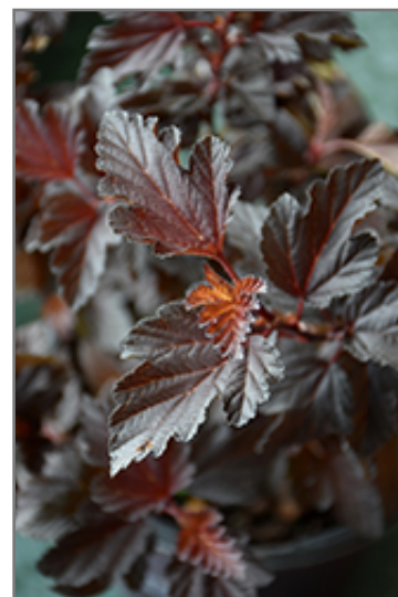
Fireside Ninebark flowers