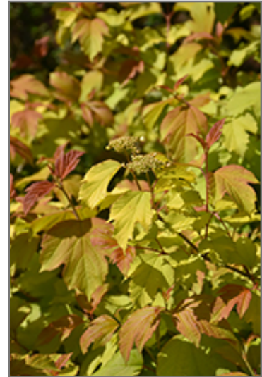
Oh Canada Cranberry Bush foliage

Oh Canada Cranberry Bush is recommended for the following landscape applications;