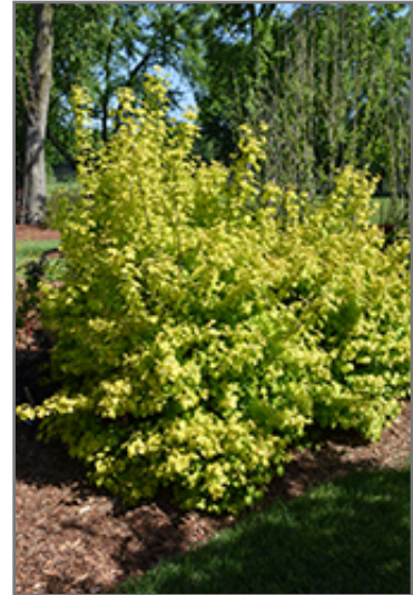
Oh Canada Cranberry Bush

This shrub does best in full sun to partial shade. It prefers to grow in average to moist conditions, and shouldn't be allowed to dry out. It is not particular as to soil type or pH. It is highly tolerant of urban pollution and will even thrive in inner city environments. This is a selected variety of a species not originally from North America.