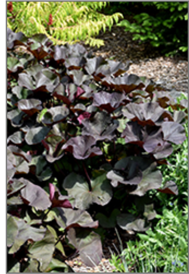
Britt Marie Crawford Rayflower foliage

This plant does best in partial shade to shade. It prefers to grow in moist to wet soil, and will even tolerate some standing water. It is not particular as to soil pH, but grows best in rich soils. It is somewhat tolerant of urban pollution. This is a selected variety of a species not originally from North America. It can be propagated by division; however, as a cultivated variety, be aware that it may be subject to certain restrictions or prohibitions on propagation.