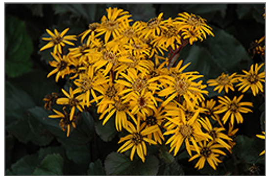
Britt Marie Crawford Rayflower flowers