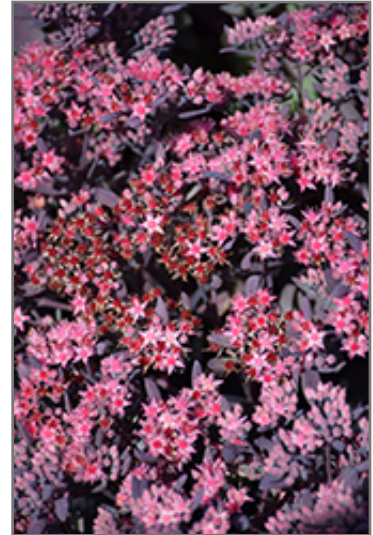
Plum Dazzled Stonecrop flowers

Plum Dazzled Stonecrop is a dense herbaceous perennial with an upright spreading habit of growth. Its medium texture blends into the garden, but can always be balanced by a couple of finer or coarser plants for an effective composition.