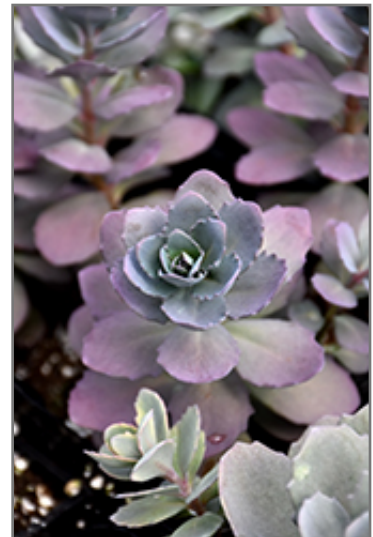
Plum Dazzled Stonecrop foliage