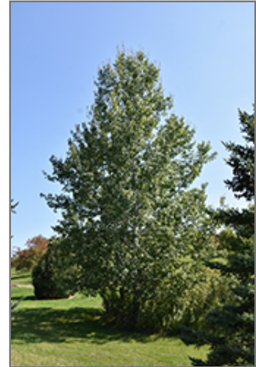
Trembling Aspen

Trembling Aspen is recommended for the following landscape applications;