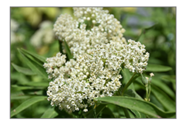
Ice Ballet Milkweed flowers

Ice Ballet Milkweed is recommended for the following landscape applications;