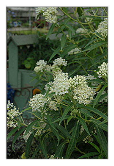
Ice Ballet Milkweed flowers

22040 Township Road 522 Sherwood Park, AB (587) 600-2231 www.sherwoodnurseries.ca