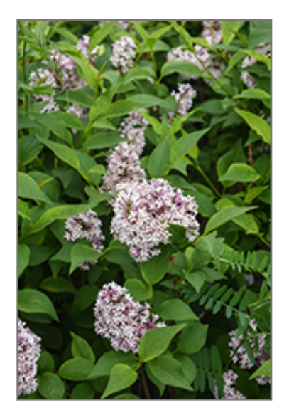
Baby Kim Lilac flowers