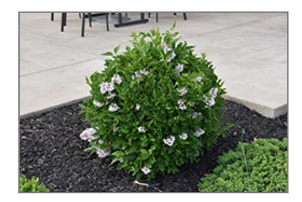
Baby Kim Lilac in bloom