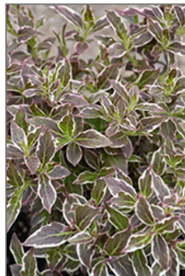
My Monet Purple Effect Weigela foliage