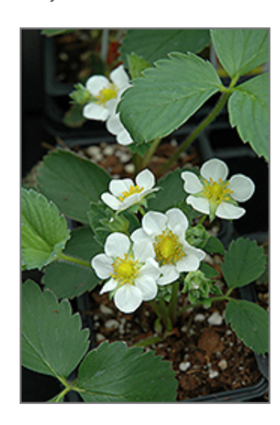
Fort Laramie Strawberry flowers