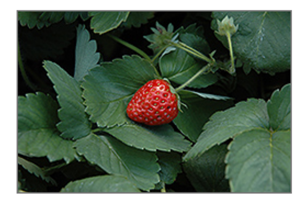
Fort Laramie Strawberry fruit

Fort Laramie Strawberry features dainty white daisy flowers with yellow eyes along the stems from late spring to mid summer. Its tomentose round compound leaves remain green in colour throughout the season. It features an abundance of magnificent scarlet berries from early to late summer.