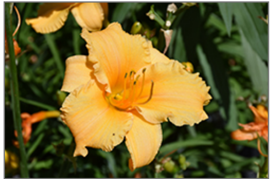
Happy Ever Appster Apricot Sparkles Daylily flowers