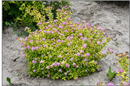
Sundrop Spirea in bloom