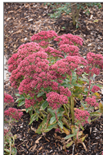
Munstead Dark Red Stonecrop in bloom