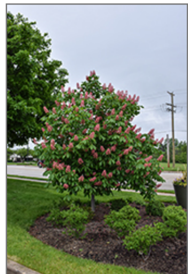
Fort McNair Red Horse Chestnut in bloom