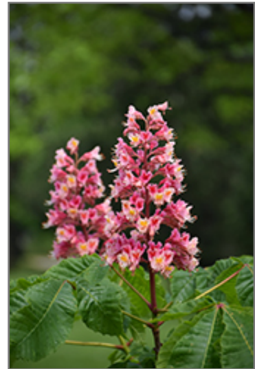
Fort McNair Red Horse Chestnut flowers