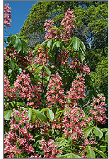
Fort McNair Red Horse Chestnut flowers

This tree does best in full sun to partial shade. It prefers to grow in average to moist conditions, and shouldn't be allowed to dry out. It is not particular as to soil type or pH. It is highly tolerant of urban pollution and will even thrive in inner city environments. This particular variety is an interspecific hybrid.